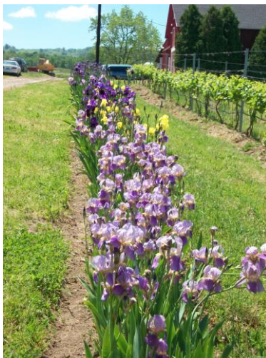
Johnson Estate Winery – Iris Lane Along Barn Road

The end of May marks the opening of Westfield's Farmer's Market and Johnson Estate plans to be a regular vendor, hoping “to support the community and to share our products with both local residents and visitors”. The winery will feature a selection of wines, but in view of the morning hours of the market, it will also offer seasonal baked goods from the Brick Village Gourmet and other bakers. The winery, open every day, will also be celebrating the blooming of the iris in its farm gardens at the end of May.